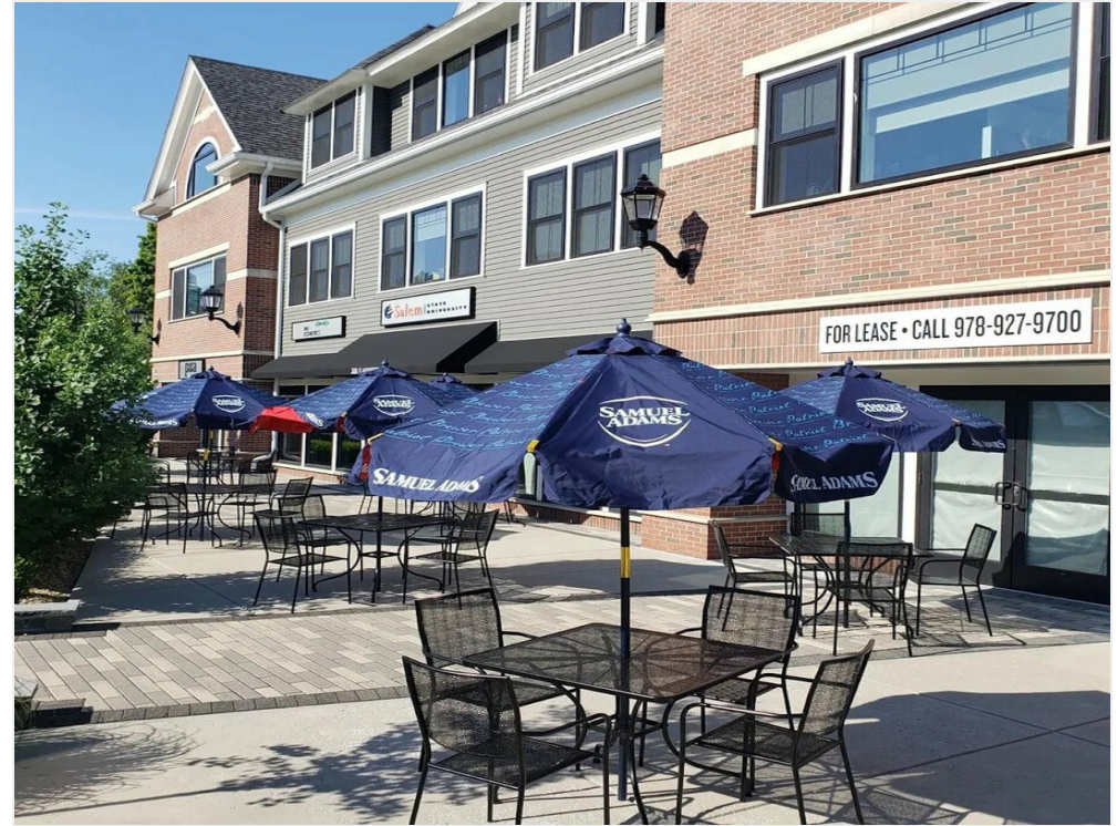
outside3 patio (2)