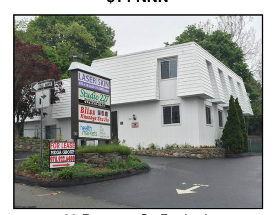
80 Prospect St, Peabody OFFICE SUITE $850 Monthly

Find The Mega Group's announcements and listings prominently featured on: