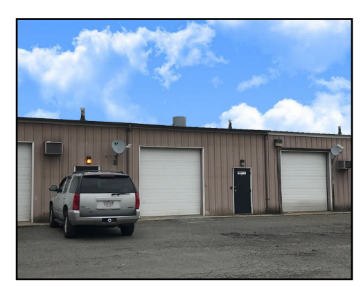
10R Rainbow Terrace, Danvers INDUSTRIAL SPACE w 12' ROLLUP $2,000 Monthly