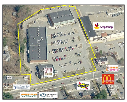
Commodore Plaza - Rte 1A - Beverly RETAIL STOREFRONT $19 PSF NNN