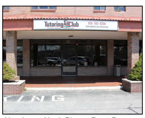
Hawthorne North Plaza - Rte 1 Danvers RETAIL STOREFRONT $2,440 Monthly