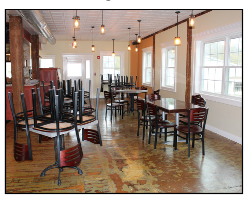
17 Railroad Avenue - Rockport T Station STOREFRONT or RESTAURANT $14 NNN