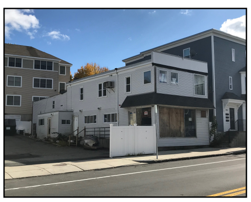
253 Rantoul Street, Beverly COMMERCIAL BUILDING FOR LEASE Negotiable