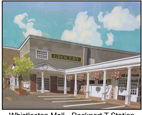
Whistlestop Mall - Rockport T Station 10,000+ SF BUILDING Negotiable