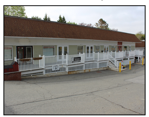
Isinglass Place - Rockport T Station RETAIL STOREFRONT $1,650 Monthly + Utilities