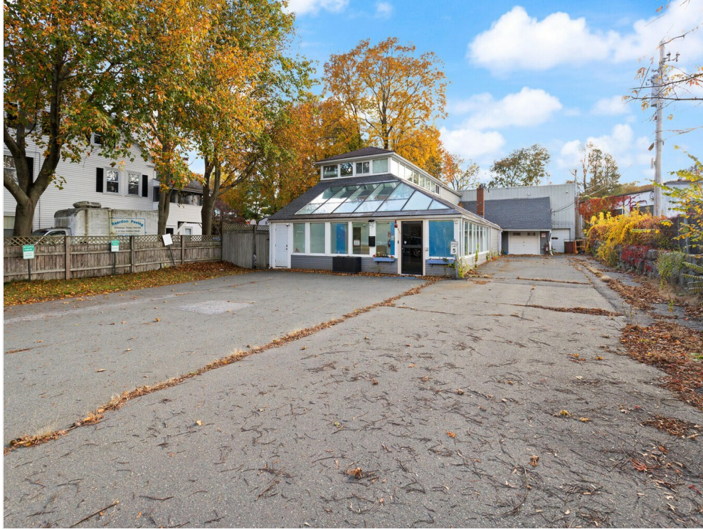
430 Maple St Danvers MA 01923 USA-005-029-Exterior front4-MLS_Size