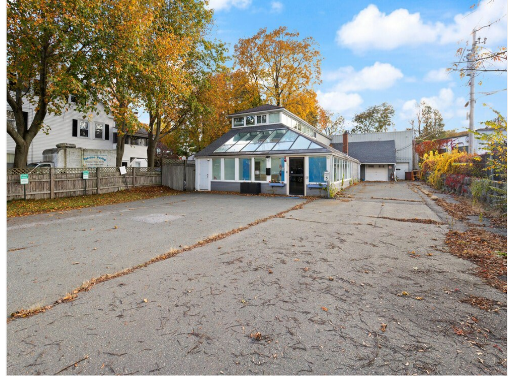
430 Maple St Danvers MA 01923 USA-005-029-Exterior front4-MLS_Size