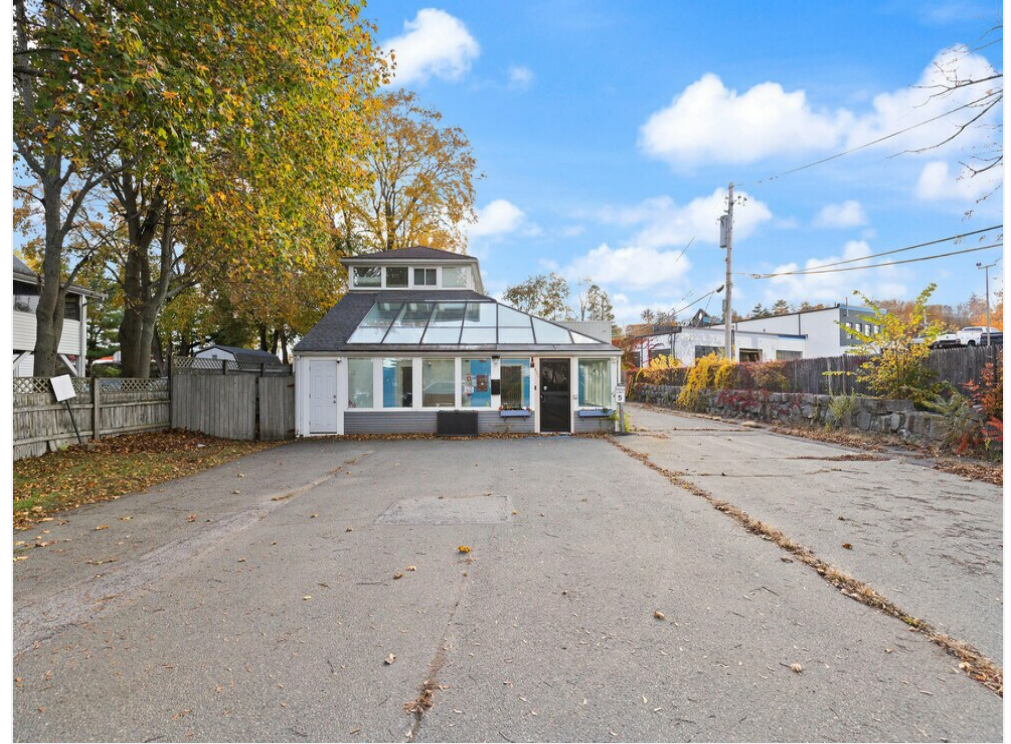
430 Maple St Danvers MA 01923 USA-003-021-Exterior front2-MLS_Size