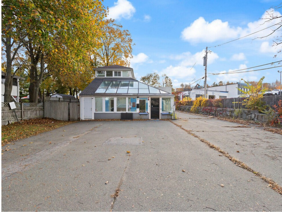
430 Maple St Danvers MA 01923 USA-004-005-Exterior front3-MLS_Size