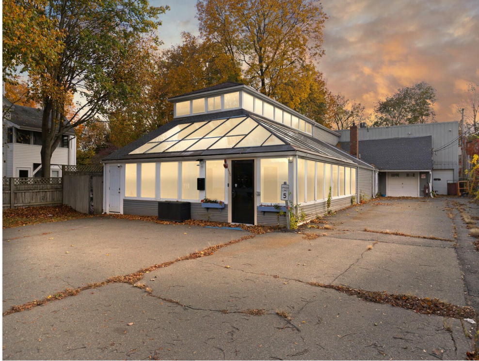
430 Maple St Danvers MA 01923 USA-001-003-Dte-MLS_Size